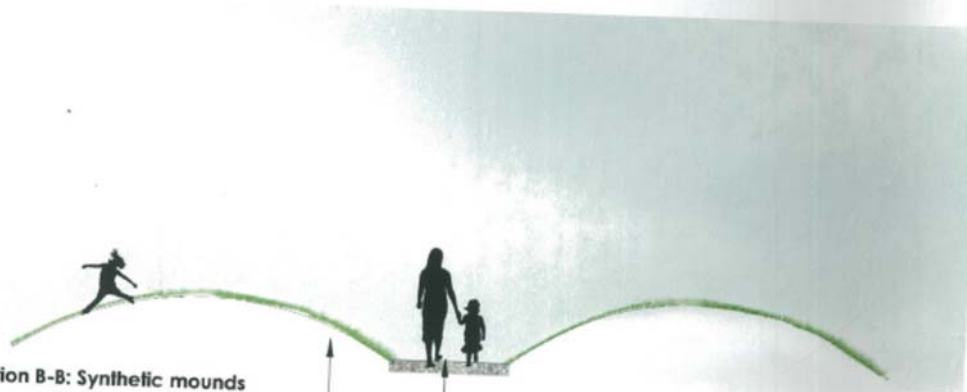
Section B-B: Synthetic mounds