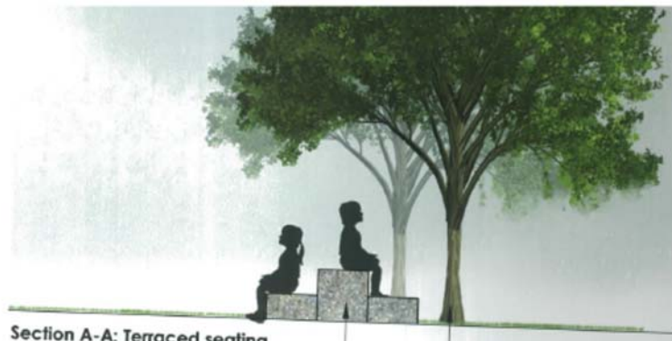
Section A-A: Terraced seating